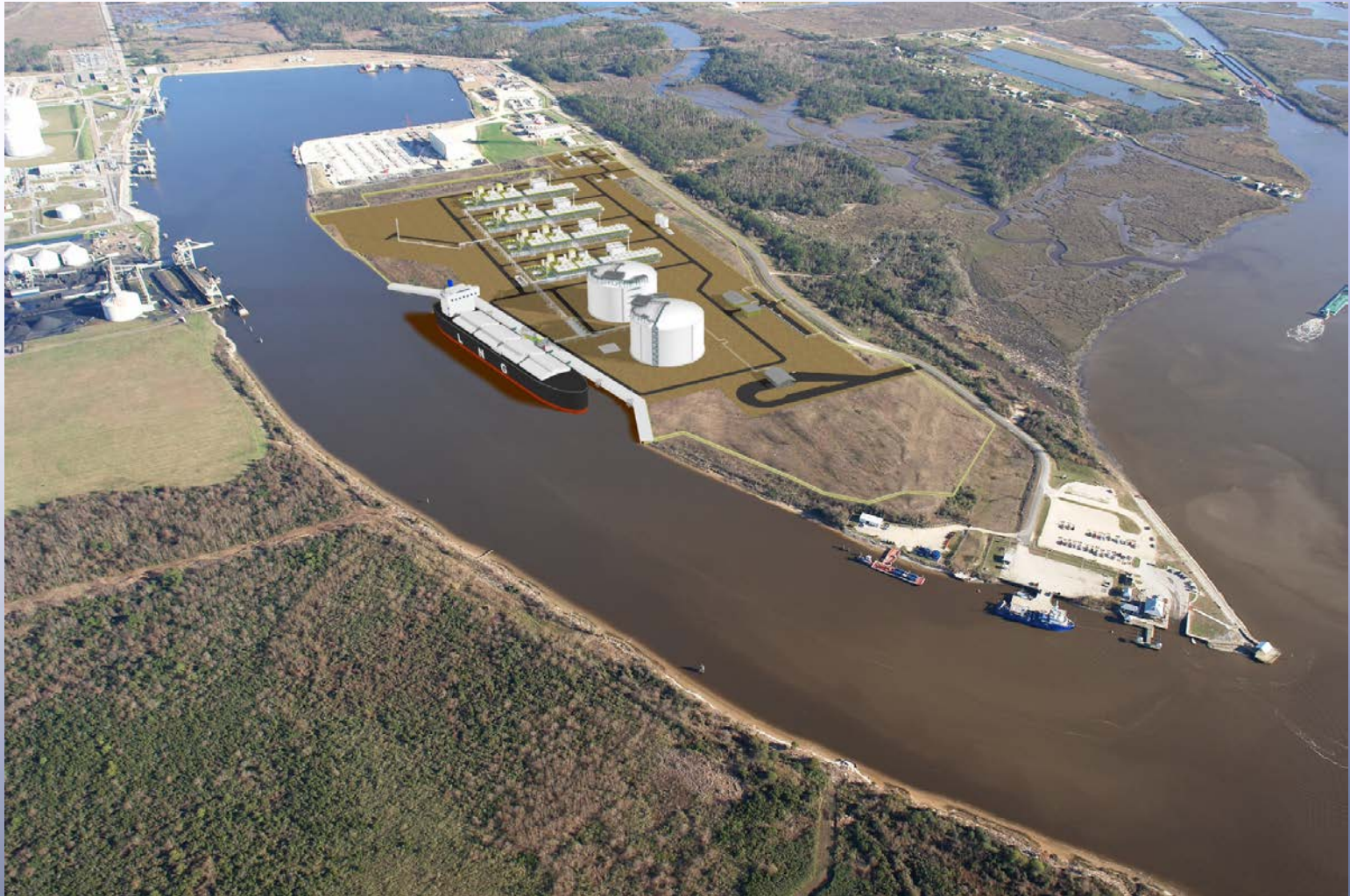
Proposed Magnolia LNG Project - 8 MTPA