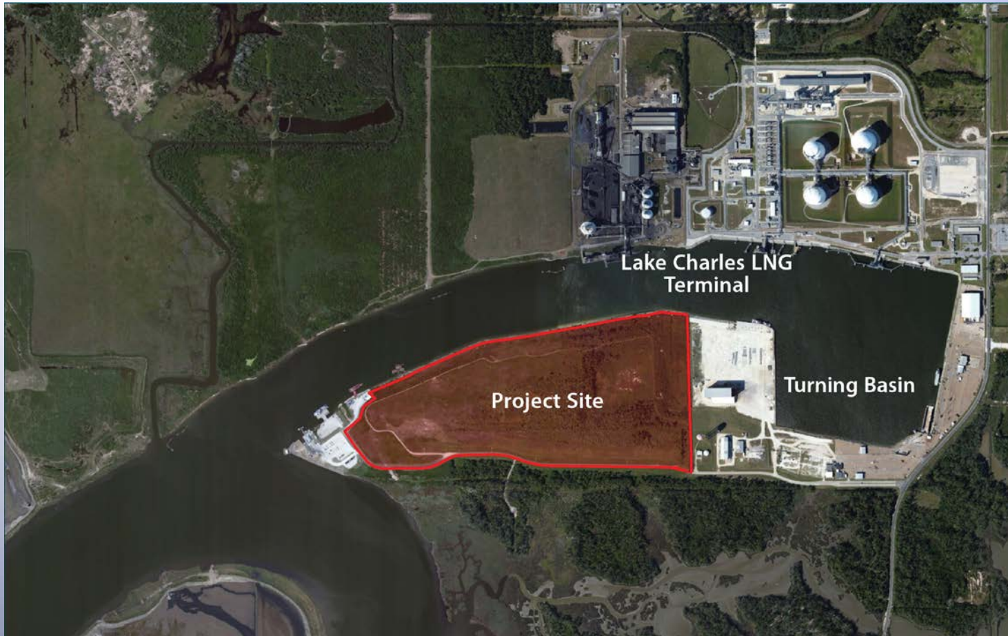
Magnolia LNG facility to be located along Industrial Canal on Port property.