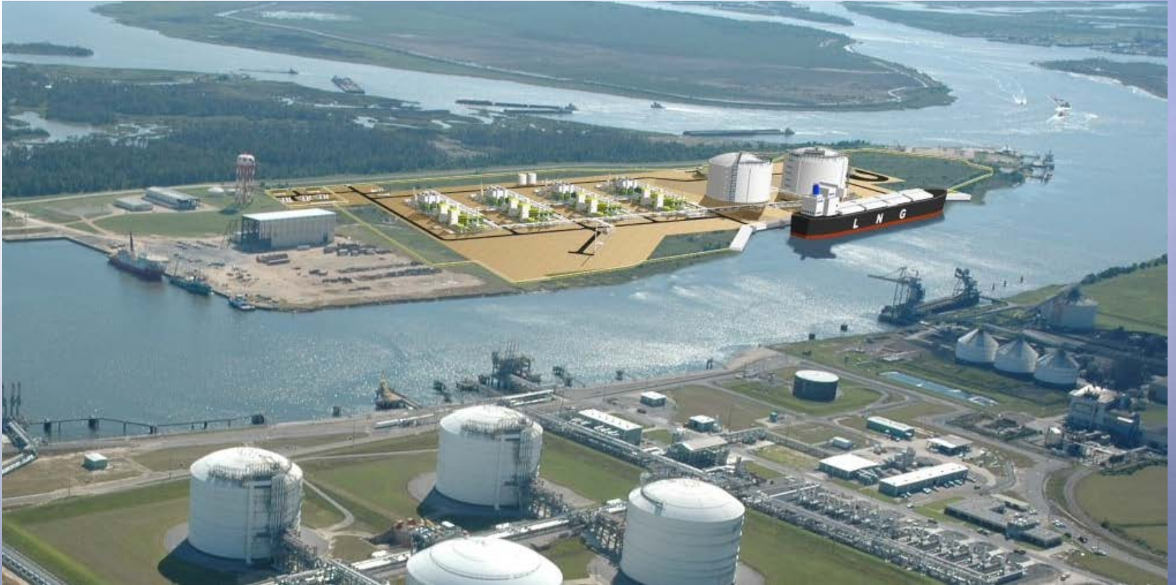
Artist's Impression of 8 mtpa Magnolia LNG facility