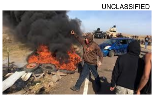
(U) Figure 2. Use of burning tires and vehicles as barricades in North Dakota during anti-DAPL protests in October 2016.<sup>28</sup>

(U) Protests surrounding the DAPL have resulted in the arrest of hundreds of individuals for allegedly committing criminal acts while trespassing and setting up encampments on DAPL property in rural