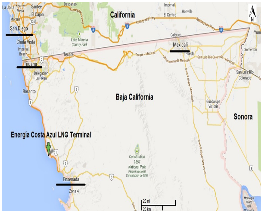
Figure 1: Location of Energia Costa Azul LNG terminal.

coastal settlements the old human groups processed their food and artifacts from hunting and fishing, this information was obtained from the accumulation of sea shells, stone ships exorcitation, several ceramics hand fragments, mortars and human bones [9].