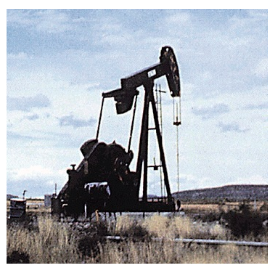
The familiar appearance of a coalbed methane gas well

Stimulation fluids that have been used in the Alabama coalbed methane fields include acid, water, foam, and gel. * * * Water was used as the stimulation fluid in more than half the wells completed prior to 1988, but since that time, water has been used in less than one-fourth of the wells. * * * Today, foam is being used more commonly as a stimulating fluid. The foam used to stimulate coalbed methane wells is a mixture of about 70 percent nitrogen and 30 percent water, as well as a surfactant, or foaming agent. * * * Since 1988, approximately three-quarters of the coalbed methane wells completed in Alabama have been stimulated with cross-linked gel. Gel is a mixture of water, thickener, and breaker, whereas cross-linked gel is a mixture of thickener and another substance, generally sodium borate or boric acid . . .. Polymers are mixed with water . . . . Breaker fluids, such as enzymatic compounds and sodium persulfate, are used . . ..<sup>11</sup>