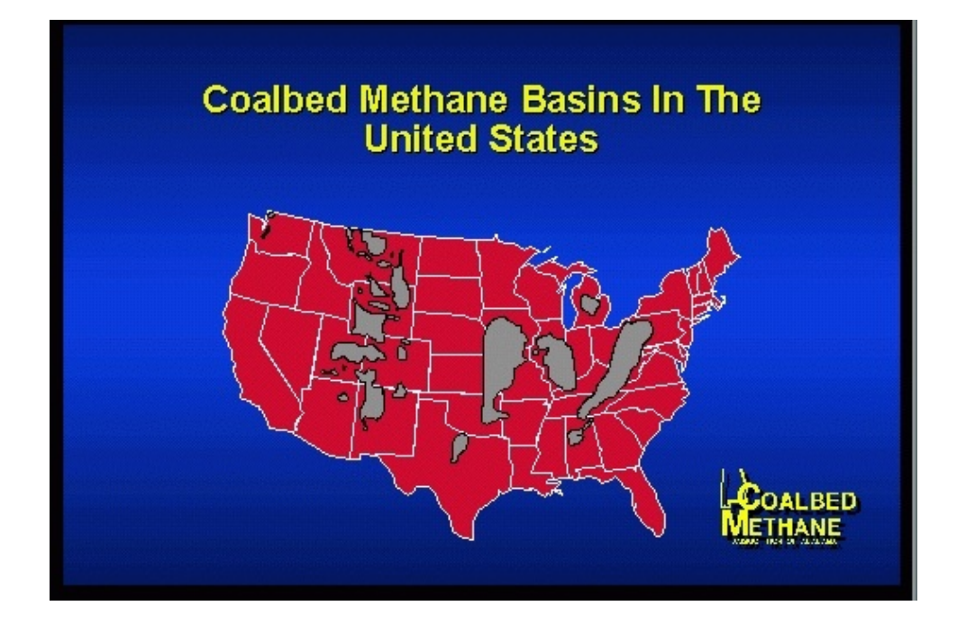
Establishing the State's Failure to Regulate Hydraulic Fracturing as "Underground Injection"

On April 26, 1989 and again on May 19, 1989, the State Oil and Gas Board of Alabama provided LEAF with informal opinions that hydraulic fracturing does not constitute a Class II well (a well used for the enhanced recovery of oil or gas).<sup>22</sup> Later, the State Oil and Gas Board of Alabama declined to act on a petition filed by LEAF on August 9, 1993 seeking a formal ruling on whether hydraulic fracturing constituted underground injection and an activity regulated by the State Oil and Gas Board's underground injection control program.<sup>23</sup>